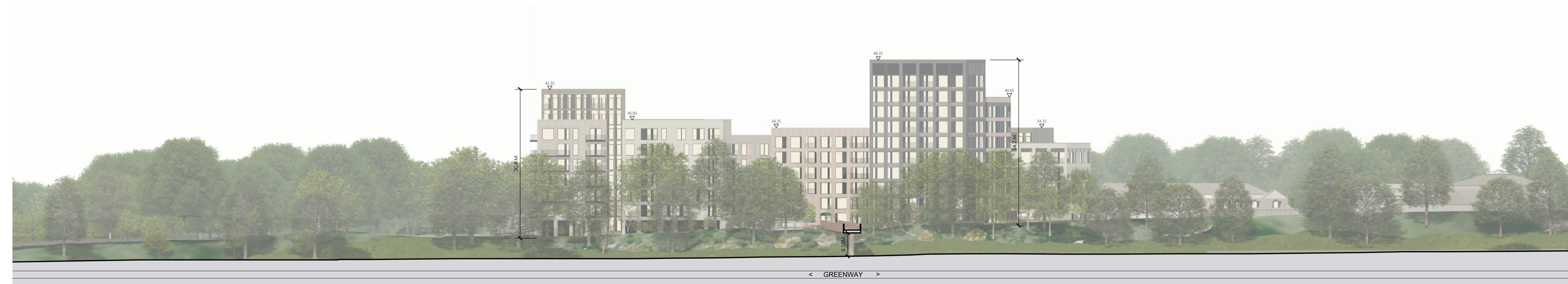
3 CONTIGUOUS SITE SECTION - GREENWAY - L3 SCALE 1:500